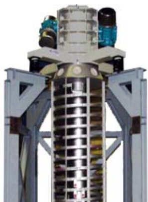
Spiral Elevators for gentle vertical conveying

The micro-throw motion of JVI vibratory equipment is gentle on even the most friable food industry products. Providing feeders with reliable and accurate feed rates and excellent repeatability is our promise to you. JVI feeders and controls out class the competition when it comes to reliability, adjustability and durability. JVI manufactures vibratory equipment for the food industry that is designed to the specific application requirements and our testing facility in Houston, Texas will ensure that feeders meet precise batching requirements.