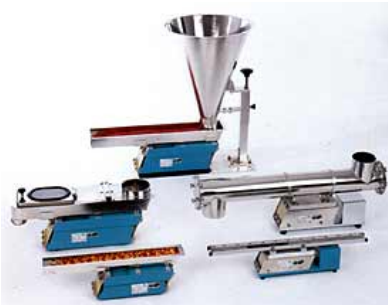
Dosing Feeders with or Without a Hopper